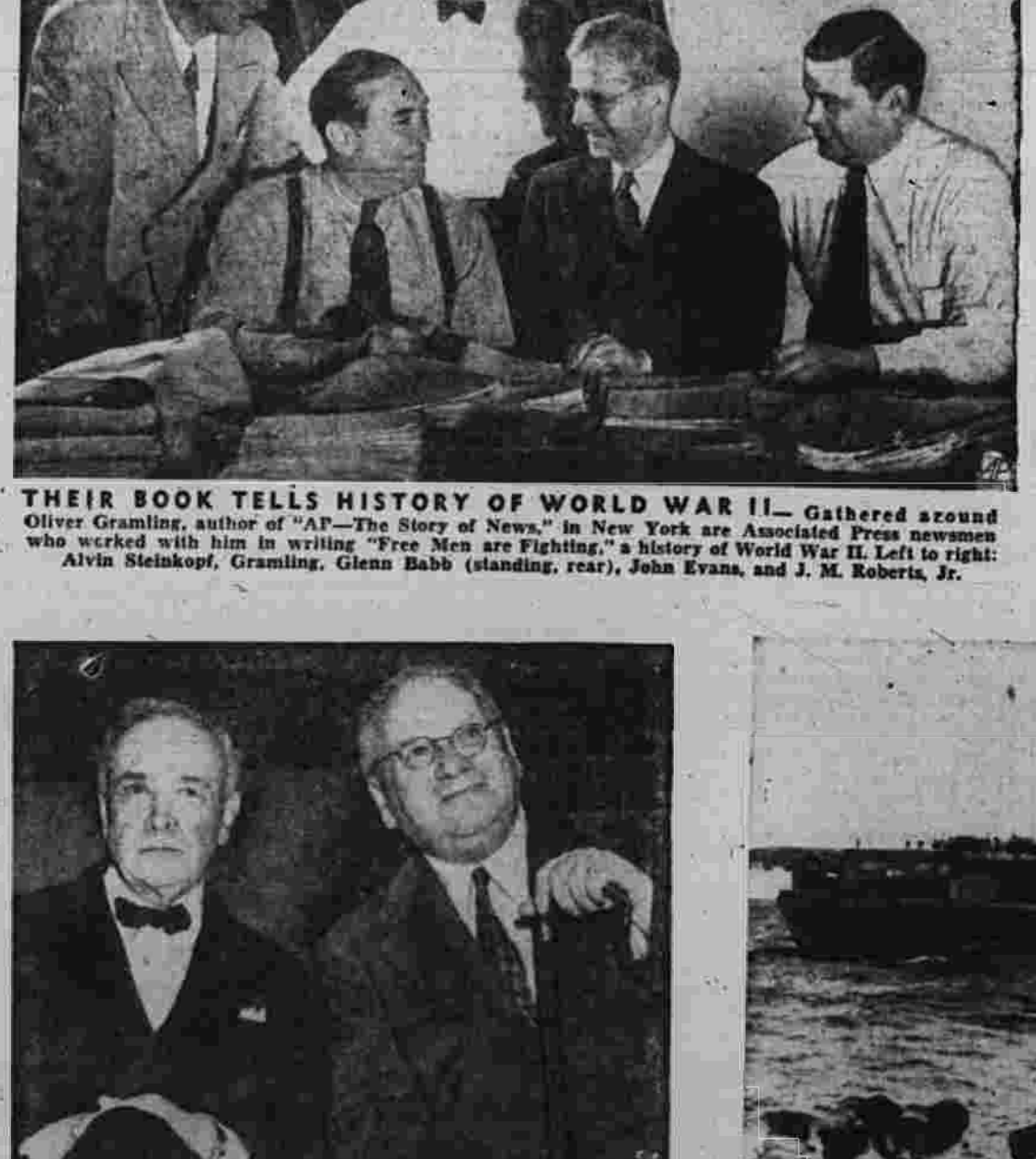
LITVINOFF AND CONDUCTOR —Soviet Ambassador Maxim Litvinoff (right) sits with Boston Symphony conductor Serge Koussevitzky after a concert at the Berklee Music Center, Aug. 26.