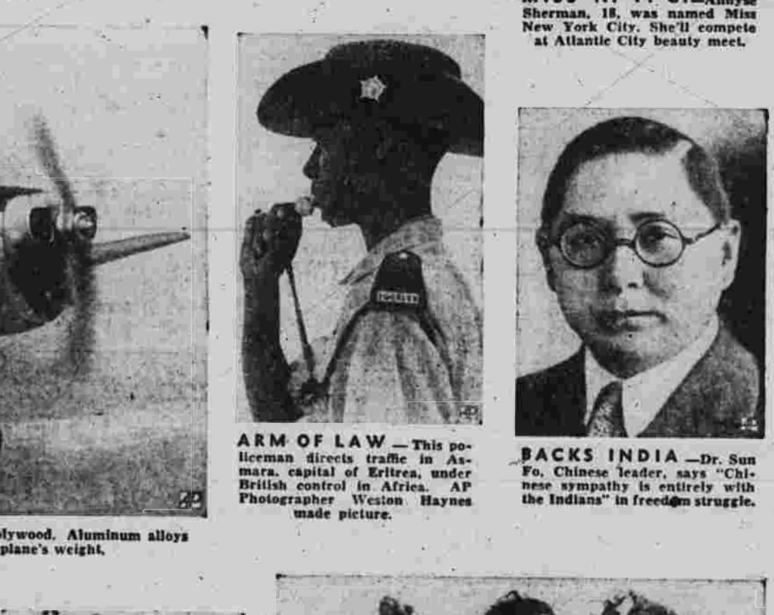
BACKS INDIA —Dr. Sun Fo, Chinese leader, says "China's sympathy is entirely with the Indians in freedom struggle."