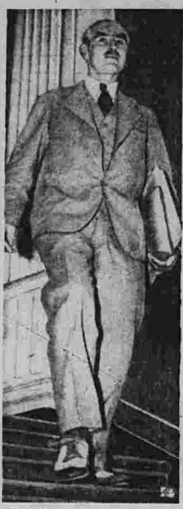
REPORTS —Joseph C. Grew, U. S. ambassador to Tokyo, on Monday, August 22, left for Japan after reporting in Washington, D. C.